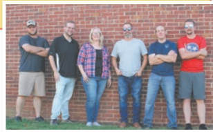
Strangers with Friends