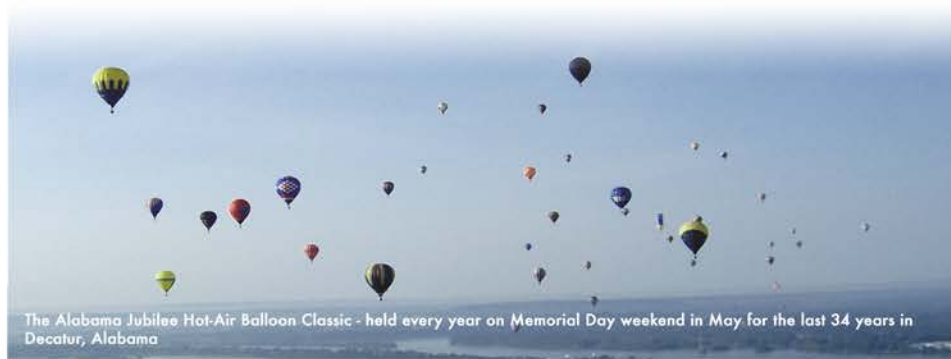
The Alabama Jubilee Hot-Air Balloon Classic - held every year on Memorial Day weekend in May for the last 34 years in Decatur, Alabama